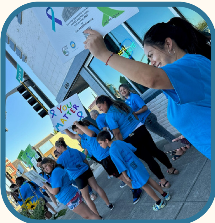
September 08, 2023

We wrapped up our month with a Native American Cultural Celebration in Corning, a large-scale event with dancing and drumming, storytelling and various demonstrations where Native Americans shared their culture. This event was made possible by a grant from the Upstate California Creative Corps and lots of assistance from community partners and social and health service organizations. This event was also smoke free.