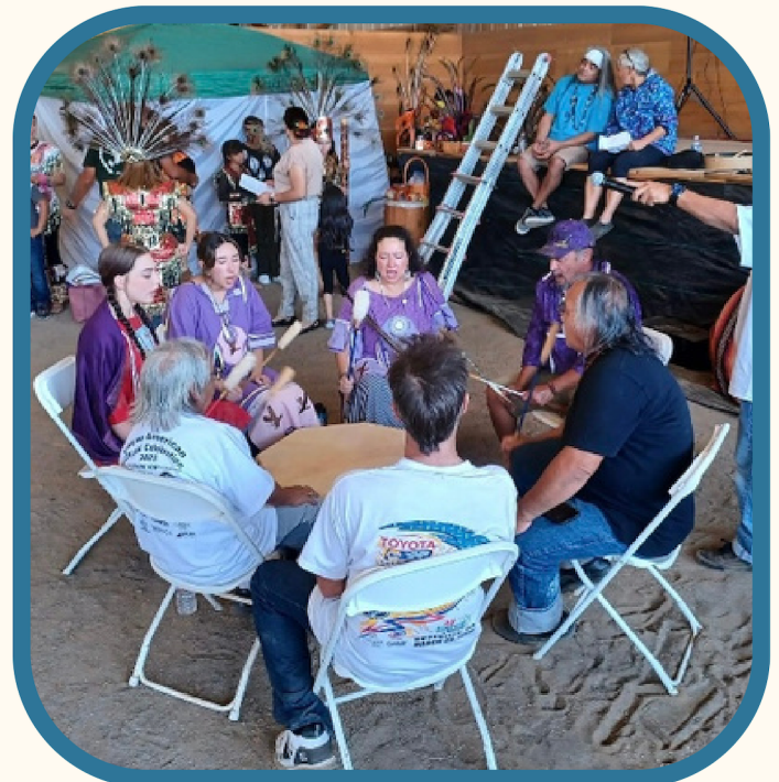
September 23, 2023