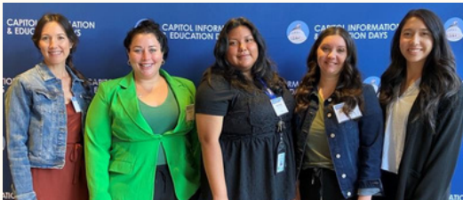
Senate District 1 Legislative Meeting