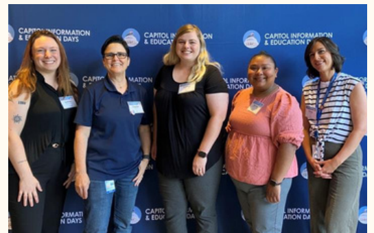
Assembly District 3 Legislative Meeting